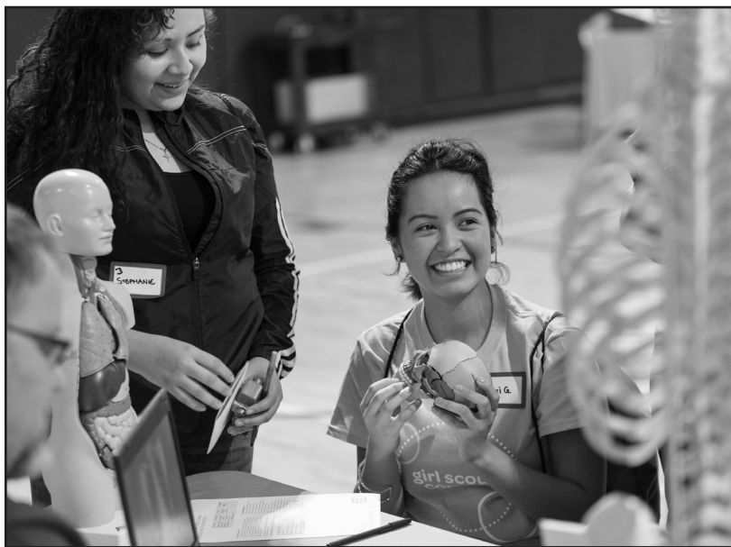
Las niñas que participan en el programa Girl Scouts ConnectZ se reúnen regularmente en su comunidad y participan en eventos especiales. En el evento “Women in Careers,” organizado en colaboración con Dunwoody College of Technology, las niñas exploraron carreras técnicas en construcción, manufactura, la industria automotriz y diseño de interiores.

The Girl Scouts ConnectZ program is making a difference in girls’ lives by helping them get the knowledge and skills that will prepare them for a positive future. If you would like more information on volunteering with a Girl Scouts ConnectZ troop or on how to partner with the program, email ConnectZ@girlscoutsvr.org or stop by the Girl Scouts booth at the La Familia Latino Family Festival and Expo on Saturday, August 6 from 11 to 3 at Neighborhood House.