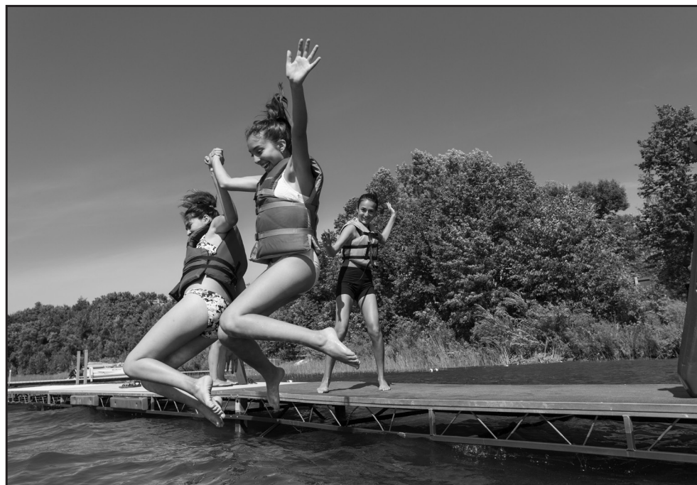
Las niñas también asisten a campamentos de Girl Scouts donde pasean en canoa y kayak, practican tiro al arco, y nadan en el lago, muchas veces por primera vez!