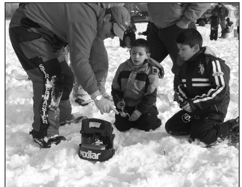
Ice fishing at Pleasant Lake near St. Cloud