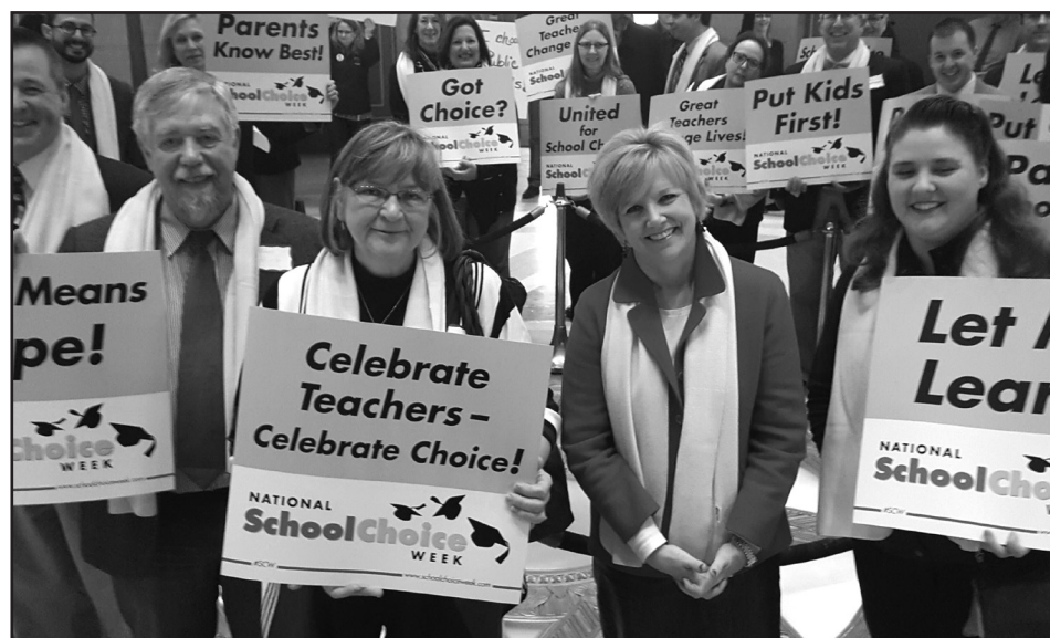
Participants at the OAK rally at the State Capitol Rotunda