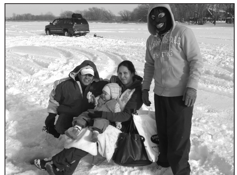
Pleasant Lake near St. Cloud