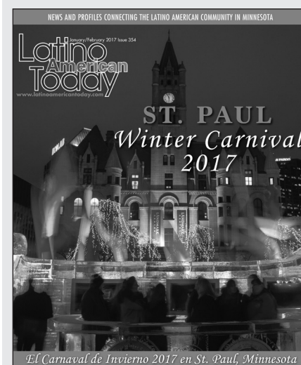
On The Cover St. Paul Winter Carnival 2017

Participemos en esta celebración al invierno en espera de la bendita primavera. Allá nos vemos!