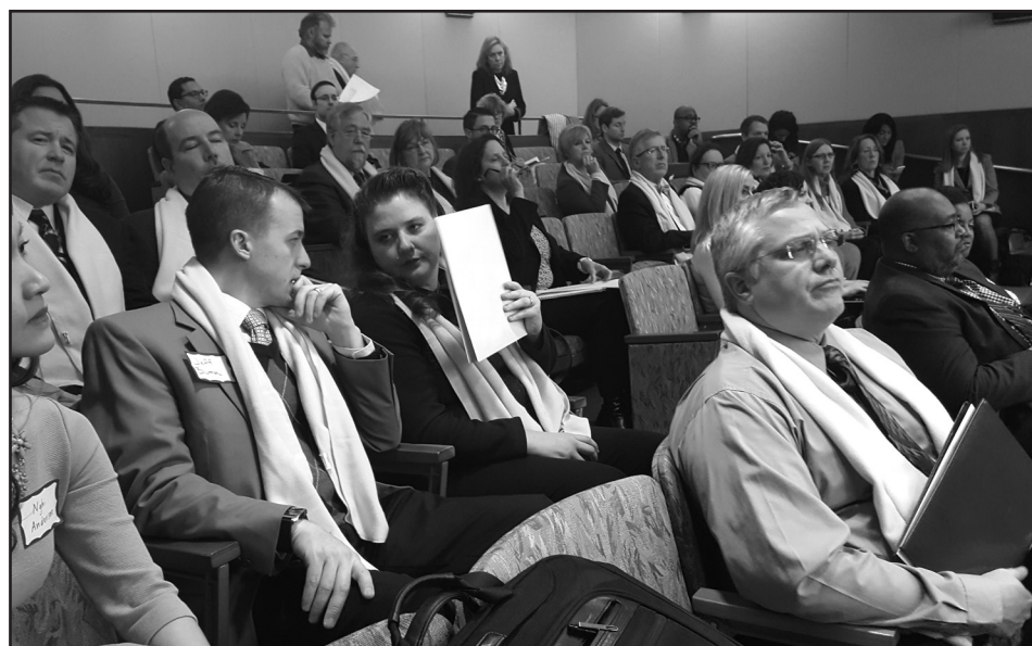
Supporters attending the hearing