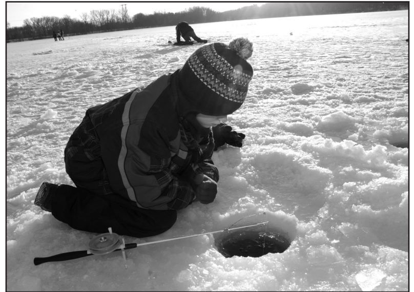
Ice fishing at Fort Snelling State Park

Go to www.mndnr.gov and search "ice fishing" for more information about where to go and how to do it. It might be the most fun you'll have until Spring!